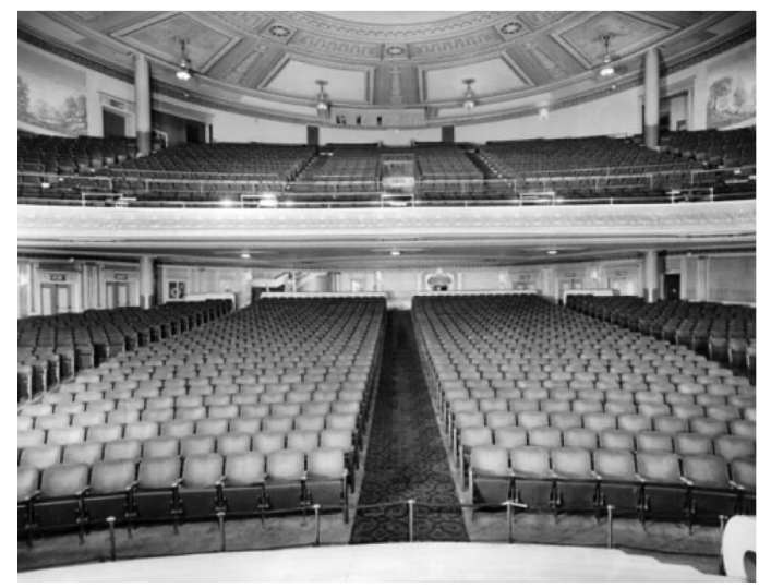
Interior of the theatre pictured in 1947.