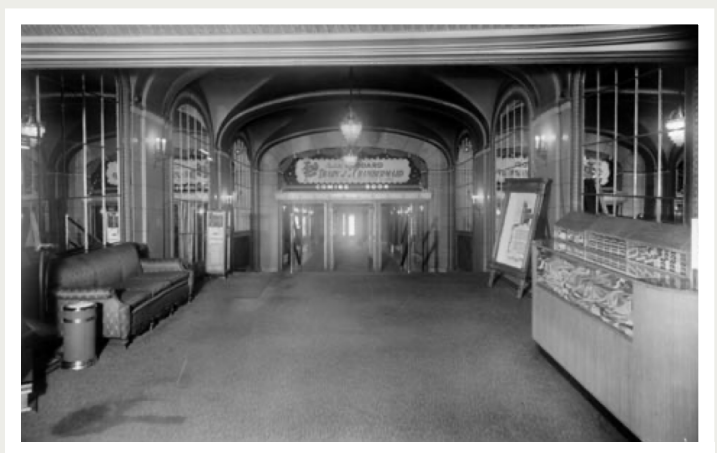
The lobby of the Capitol Theatre.