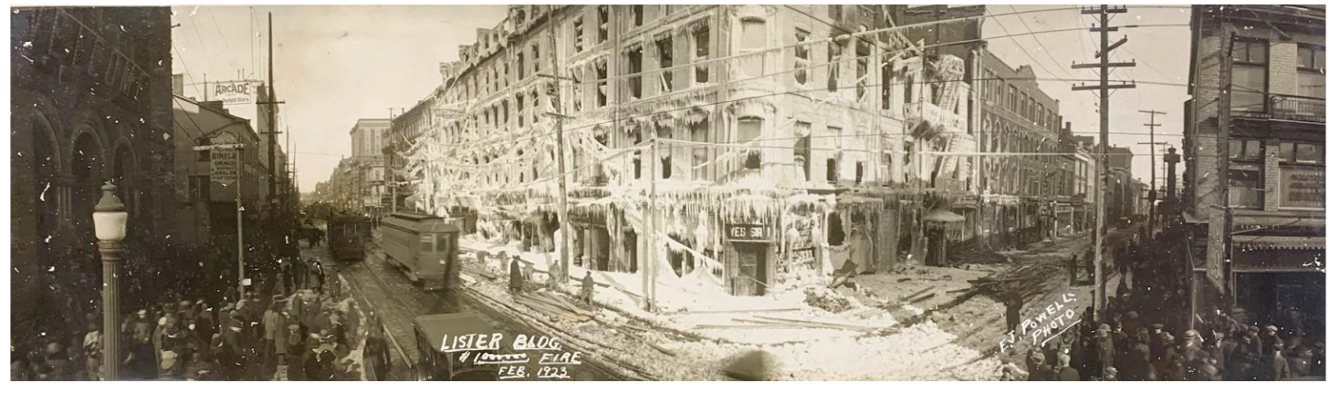
Aftermath of the 1923 fire at Lister Block.

The Lister Building we know today was built on the same property and opened on May 1, 1924. It featured a terracotta lower façade and a unique L-shaped two storey shopping arcade.