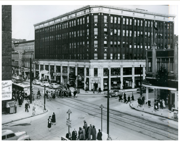
The Lister Block pictured at the corner of King William Street and James Streets. This is how the new building built after the fire appeared, similar to today's Lister Block. Zellers can be seen on the opposite corner.