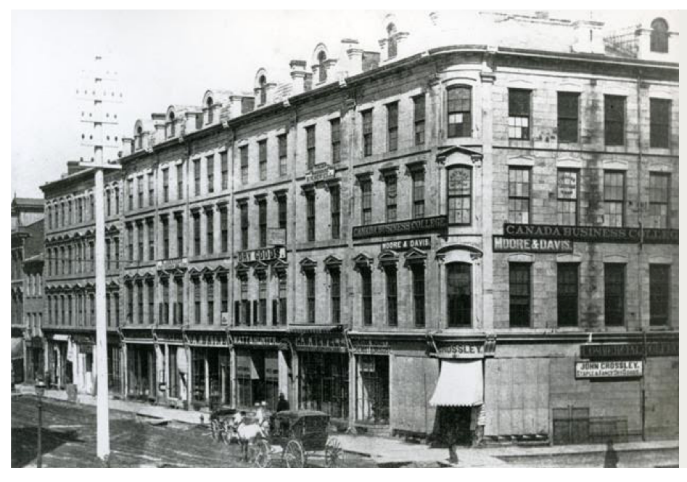
The Lister Block as it was in the 1800s.

On Thursday February 23, 1923 at 2:36 a.m., a fire was reported in the Lister building at 34 James Street North at King William. The building was totally destroyed by the fire. Every piece of equipment and firefighter in the city was called out to fight the huge blaze. It was determined that the fire started in the rear of the Hudson Fashion Shop then rapidly travelled throughout the entire building. Within half an hour all four stories were engulfed in flames. In total 77 businesses were completely destroyed. The total loss was estimated at over $1,000,000. This was the worst fire in the city's history to that date, it was so cold that the water froze as it was being poured on the building. What was left of the walls was torn down on March 23, 1923.