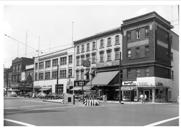
In this 1950s picture Leed's can in the Norwich Apartments building at the corner of King Street East and Catharine Street.

125 King Street East was constructed circa 1850 as a three-storey stone warehouse. By 1864, the building was occupied by Buchanan, Harris & Company hardware. Hope Adam & Company moved into the building by 1867 and expanded into an additional two-and-a-half storey stone structure to the north at 13 Catharine Street, which was constructed circa 1893 and was connected to 125 King Street East via a stone overpass. Hope Adam & Company operated out of the buildings until 1895 when Hamilton Hardware moved into 125 King Street East (formerly 121 King Street East). Hamilton Hardware operated out of the building until 1900.