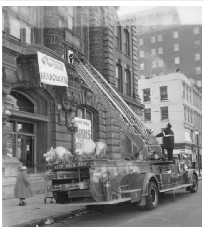
Terminal Building 1956. The Fire Department erects a sign on the building for their Muscular Dystrophy Campaign.