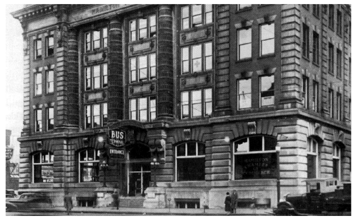
The Terminal Building in 1935.