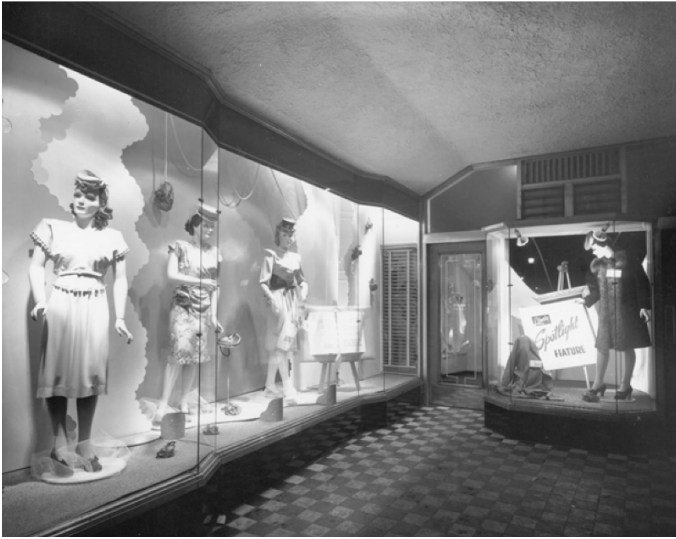
Display windows out front of Liberty Women's Wear, 1946.