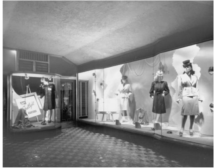
Display windows out front of Liberty Women's Wear, 1946.