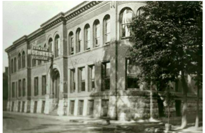
44 Hughson St. when it was Canada Business College.

Canadian Cannery Ltd served for 80 years as the Hamilton headquarters for a network of dozens of canneries across Canada that produced brand powerhouses Aylmer and Del Monte. The group tried canned product items as varied as pigs' feet, lambs' tongue, parsnips and turnips, but the staple would become Aylmer canned goods.