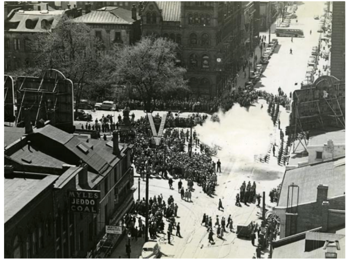
In this photo of a crowd attending the noon-day program of Fourth Victory Loan in Gore Park in 1943 the sign for Miles coal can be seen in the bottom left.