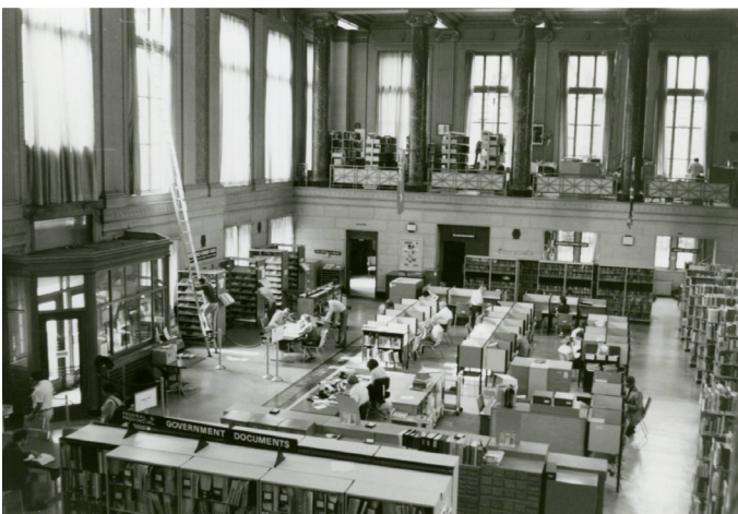
When the building was used as a Reference Library.