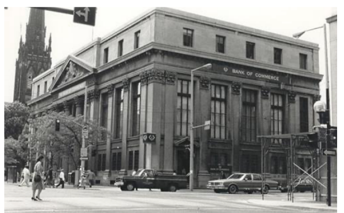
View of the northeast corner as seen from the intersection of Main St. and James St.

The Merchants Bank came to Hamilton in 1868-69 and called the south west corner of Main and James home. The building shown was demolished by the Bank of Montreal so the new main branch could be constructed in 1928.