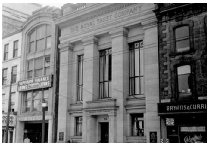
The Royal Trust Company.

54 King Street East housed the Royal Trust Company (1956-1964), a real estate office (1970s) and The 54 nightclub (1980s). It has been most recently known as The Embassy nightclub.