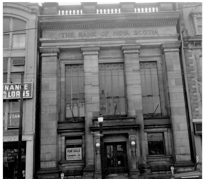
54 King St E as the Bank of Nova Scotia.

54 King Street East is one of only two known examples in Hamilton of the work of Toronto architects Bond & Smith, who also designed the MacKay Building at 66 King Street East. The Bank of Nova Scotia was incorporated in 1832 and the first branch opened in Hamilton in 1902 on the corner of King and John Streets. In 1914, the bank moved to 54 King Street East, which it occupied until 1954 when the main branch moved to 12 King Street East.