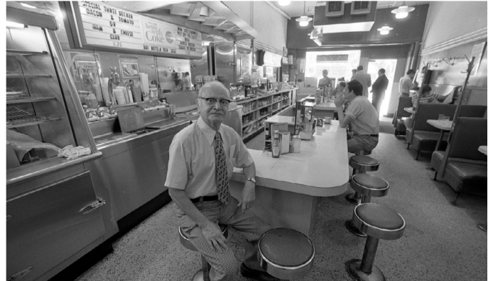
A view of the inside of White Grill. Every location of the White Grill had a reputation for great milkshakes, burgers, fries and old-fashioned pies.

The current building at 4 Hughson Street South was designed by architects Allward and Gouinlock (Don Mills) and was constructed by Pigott Structures Company Limited (Hamilton) in 1979 for the Norwich Union Life. The building was constructed on the former site of the Gore Bank (later the Bank of Commerce) which was located there from the 1840s to 1929. 4 Hughson Street South was originally occupied by the Continental Bank of Canada in the first floor and offices in the upper storeys. In 2012, the building was known as the HSBC Building and it was occupied HSBC and triOS College in the ground floor.