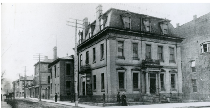
Gore Bank in the 1890s with a view down Hughson St.