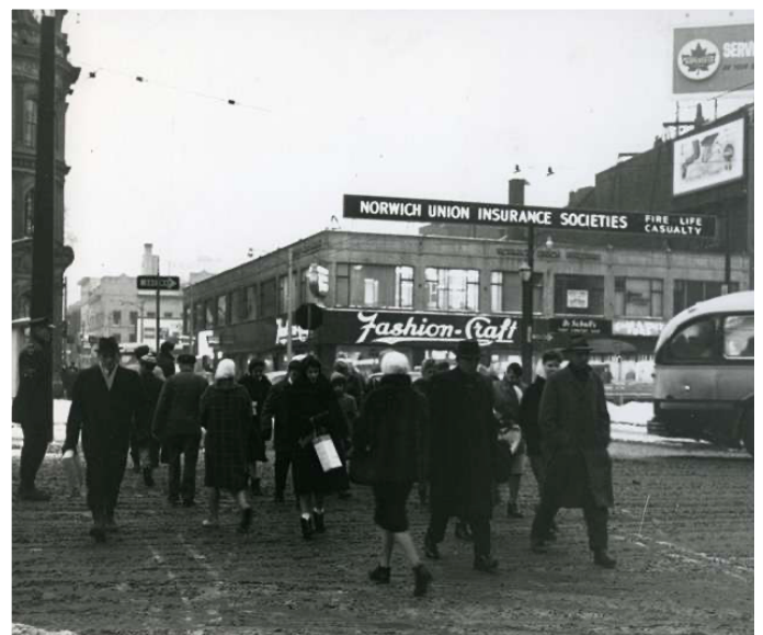
The two-storey Norwich Union Building was the next to occupy this corner, built in 1929. It remained until its demolition in 1977..

The building was erected around 1848 and it was located on the southwest corner of King Street East and Hughson Street South. It was originally two storeys high, but in the intervening years a third storey, with a sloping roof, was added. Circling the top of this addition was a lower iron grating not unlike the lawn fence. Later, a small wing was added to the west side of the original building and slight alterations were made to the front entrance. In 1929, the Canadian Bank of Commerce merged with the Bank of Hamilton that was located at King and James Streets. This building was demolished in June 1929. The two-storey Norwich Union Building was the next to occupy this corner until its demolition in 1977.