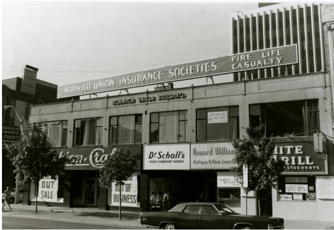
Back In the 1960s, there were several locations of the White Grill in Hamilton's downtown. The location pictured above within the Norwich building was a popular spot.