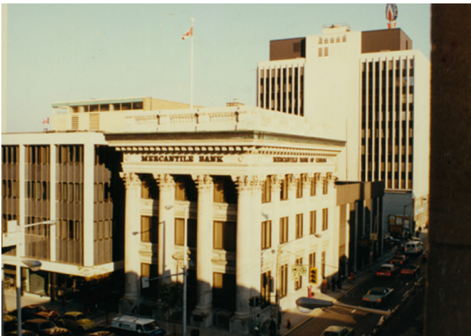
Exterior view of the Mercantile Bank of Canada, built in 1908 and located at 47 James Street South at Main Street East.