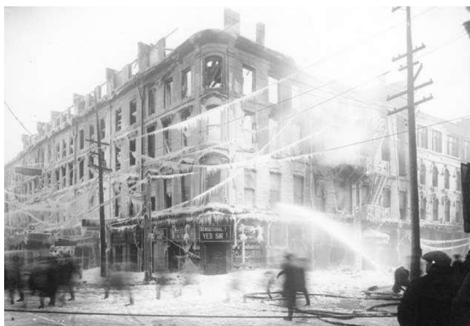
Aftermath of the 1923 fire at Lister Block.