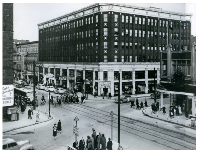
The Lister Block pictured at the corner of King William Street and James Streets. This is how the new building built after the fire appeared, similar to today's Lister Block. Zellers can be seen on the opposite corner.