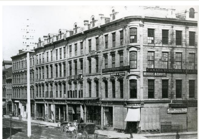
The Lister Block as it was in the 1800s.