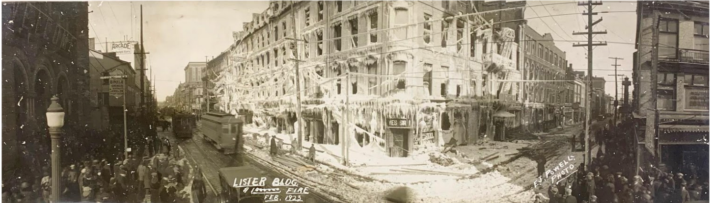
Aftermath of the 1923 fire at Lister Block.

The Lister Building we know today was built on the same property and opened on May 1, 1924. It featured a terracotta lower façade and a unique L-shaped two storey shopping arcade.