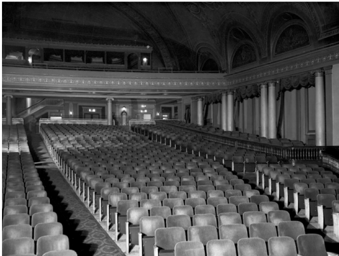
The lower seating level facing the back of the theatre. Balcony seating is on the upper level.