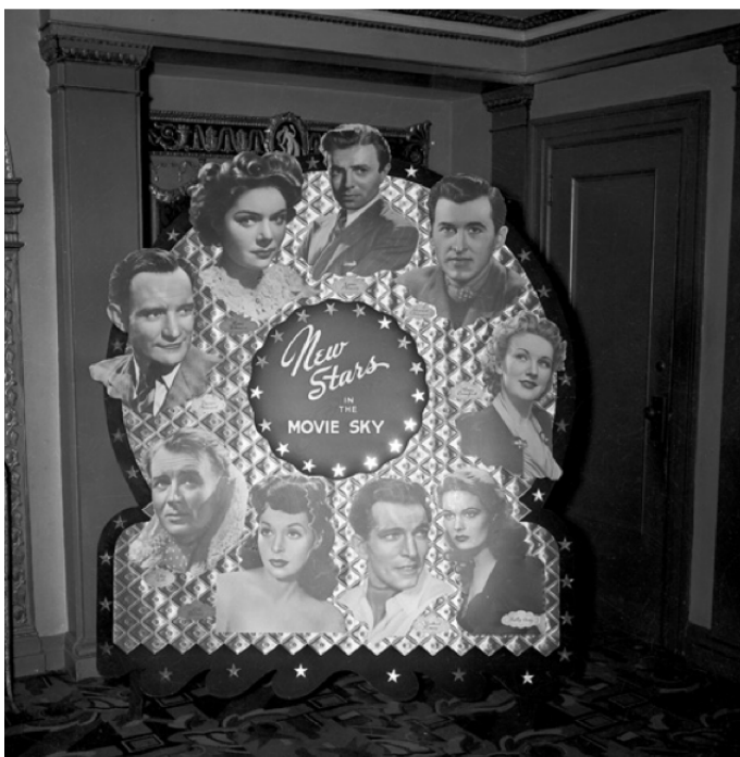
An advertisement in the lobby. The Palace Theatre was located at 137 King Street East. The theatre was opened in 1920 as a combination vaudeville and motion picture theatre called the Pantages. In 1930 it was renamed the Palace.