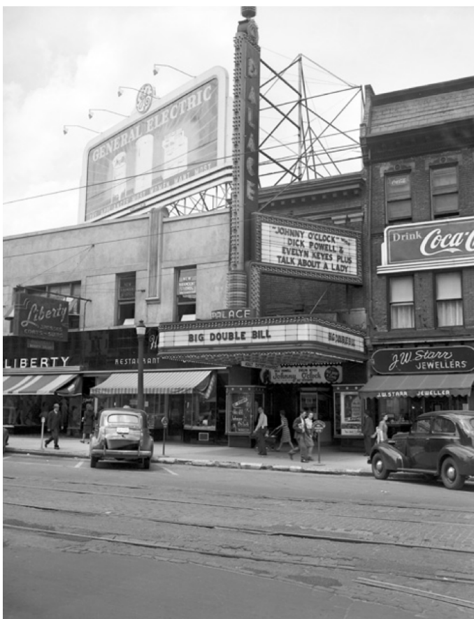
Palace Theatre pictured in the 1940s.

Pantages, the city's first million dollar theatre, was built as a combination movie and live theatre venue designed by noted architect Thomas Lamb, who was also responsible for New York's Radio City Music Hall. The building was modified and renamed the Palace in 1930 after being taken over by the Canadian Famous Players Corporation. The Palace had a marquee extending out over the sidewalk on King Street East and a large neon sign surpassing the height of the building. The first 3-D film in Hamilton was shown here in 1953. The theatre had 2007 seats. The Palace Theatre building was demolished in 1972.