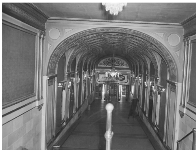
Looking towards the King St. entrance to the theatre.