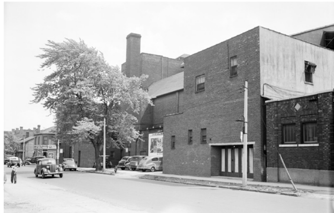
The rear doors to the Palace Theatre facing King William Street.