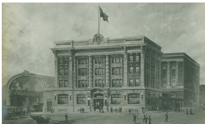
J. A. Johnson's drawing of the proposed Terminal Building, designed by Charles Mills, to be built at the corner of King Street East and Catherine Street. The barn-like structure on the left was not built. The building was opened November 1907.