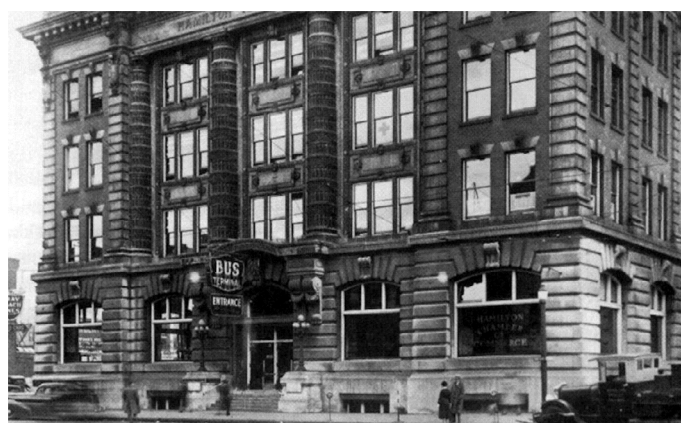
The Terminal Building in 1935.

This factory was demolished to build the Hamilton Terminal building. This housed the terminal station and general offices for the Dominion Power and Transmission Company, Limited. The offices of the Cataract Company and Hamilton Electric Light and Power Company were also located in this building. The building was demolished by March 1958.