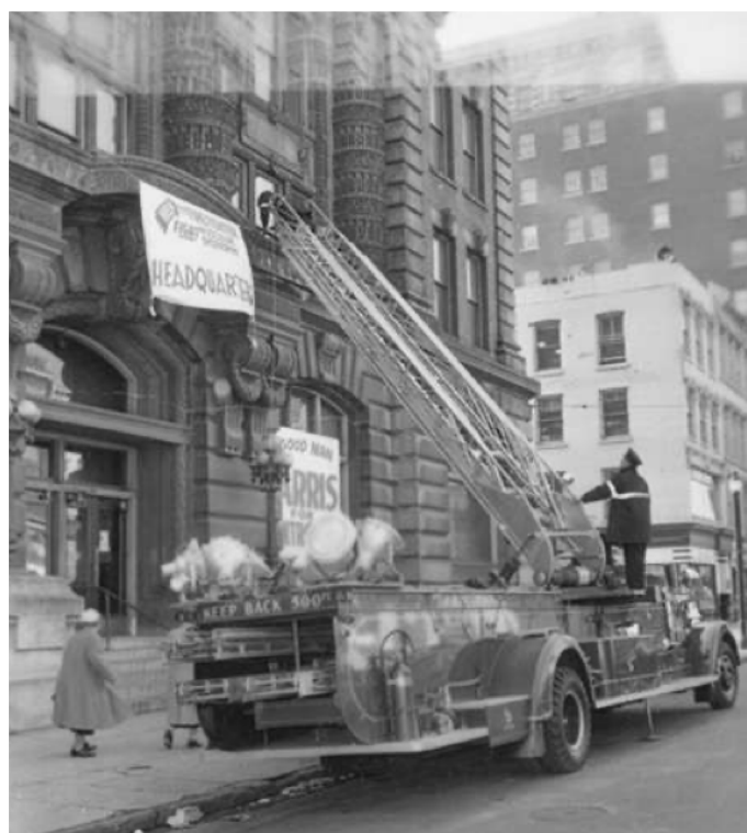
Terminal Building 1956. The Fire Department erects a sign on the building for their Muscular Dystrophy Campaign.